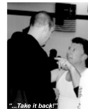
"...Take it back!"